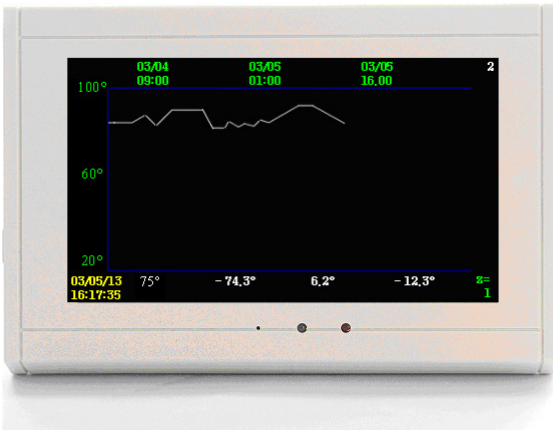
Temperature chart for one sensor

In addition to showing the current conditions, the TV2 can display the temperature history. Touching one of the temperatures causes the temperature history to be shown in an easy-to-read chart format. The chart can be scrolled backwards and forward. It can also be zoomed into or out of to show more or less data.